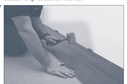
Once you have positioned each "short end" into place use a rubber mallet to tap the drop lock system into action. This should be done on every short end joint. The long ends do not require any additional force to lock into position.