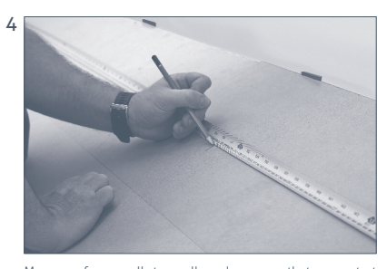
Measure from wall to wall and ensure that you start installing in a logical place to minimise any cut planks to the perimeter of the installation. Mark a "starting line" on the floor with your pencil. Ensure that you include the 5mm expansion gap when measuring. More information in the detailed fitting instructions in each box.