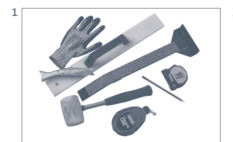
As a minimum, to install Craftsman flooring you will require a Stanley knife, tape measure, rubber mallet and a pencil. If you use a professional flooring installer, they will have all the right tools for the job.

We recommend that you have Craftsman flooring installed by a professional installer. However, should you wish to install it yourself, please use the easy-to-follow guide below. Incorrect fitting may affect the warranty of the flooring.