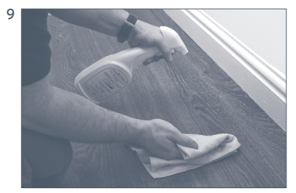
Give your flooring a good clean down and it can be walked on straight away. Using a professional cleaning kit like the Luvanto Luxury Cleaning Kit (see www.luvanto.com for more information) is the best option to ensure you can enjoy your new flooring for years to come.