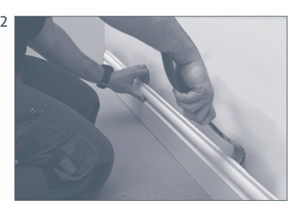
A 5mm expansion gap is needed around the entire perimeter of the flooring. You may wish to remove the skirting boards and replace after installation or use Scotia beading to cover the expansion gap. In this instance we have removed the skirting boards.