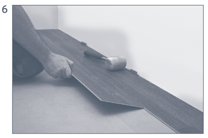
Start the installation by angling each plank into the click locking system along the long ends and then lay each plank flat to the floor. The long ends have a click lock system to hold each plank in place. The short ends have a drop lock system. More details in the detailed fitting instructions.